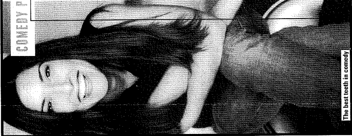
The best teeth in comedy